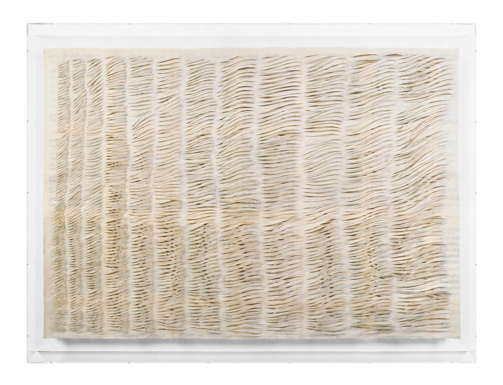
Figure 3: Here, i.e. W\!est , 2011. © Georgia Russell