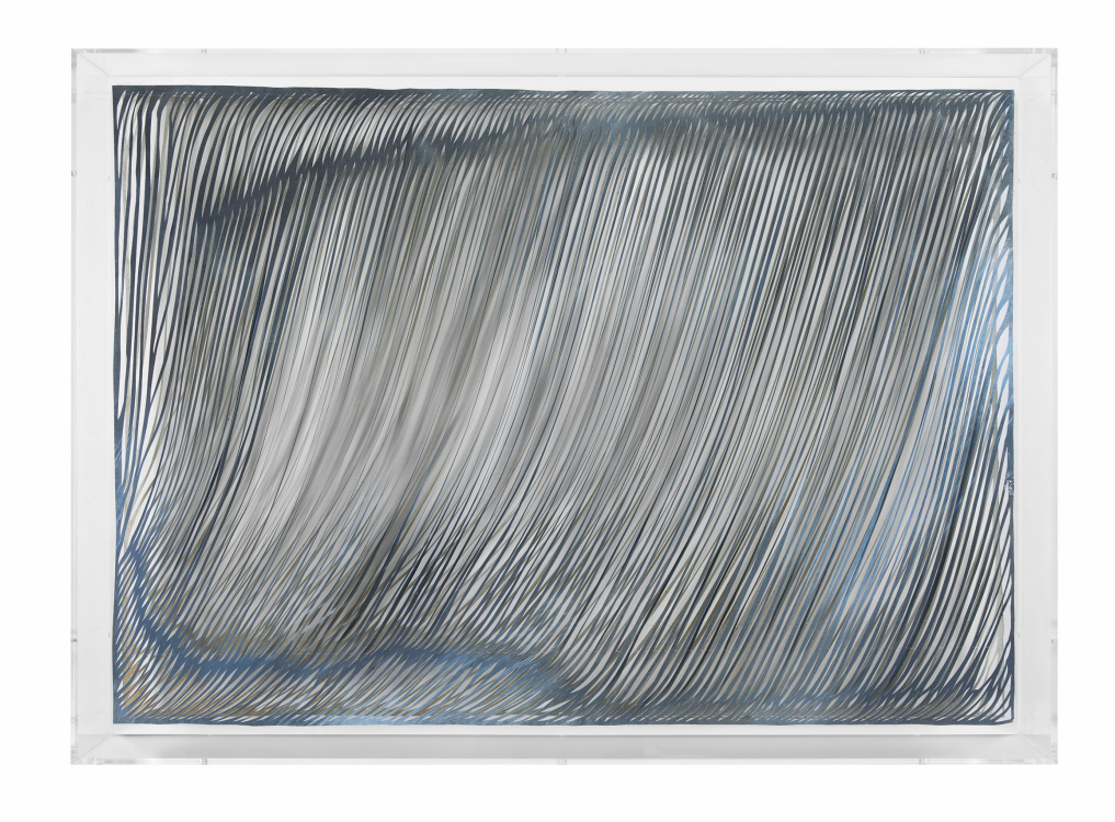
Figure 7: Precipitation I, 78x108x12cm, 2015. © Georgia Russell

time in landscape. One can also feel a more personal sense of urgency in Russell's works that is not directly related to the landscape theme but rather to the artist's success. Her very simple but effective Precipitation\ I\ (2015a) , is both about time and water. But as the title indicates when read both in French and in English, it has a double meaning: it is both about the gathering of water and waiting hurriedly for something. The artist confided that she liked this work so much that she tried to make another entitled Precipitation\ II\ (2015b) . In fact, the artist has met with such success that all the works she produces are sold to an increasing number of collectors. As a result, Georgia Russell can only keep certain traces of her own works, which means that she is herself caught up in a cycle, that of perpetual creation.