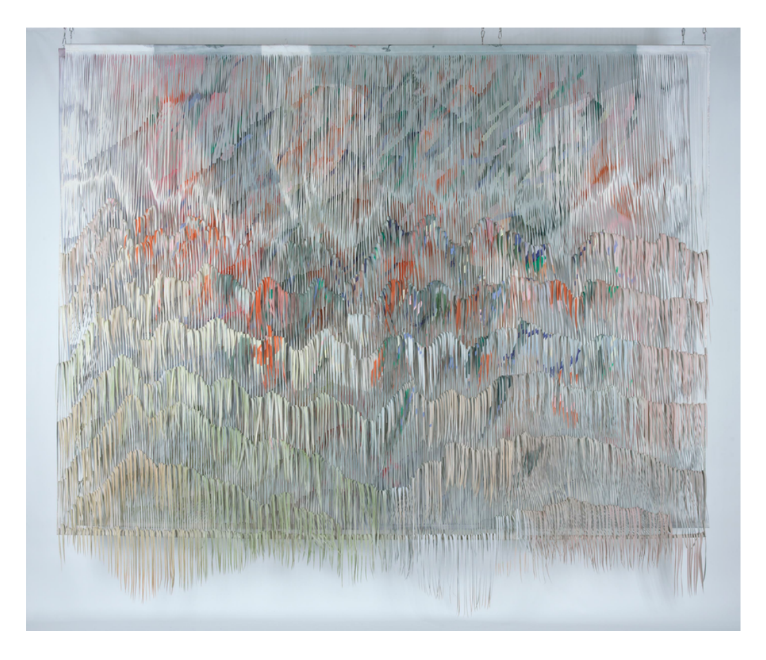
Figure 5: Escarpement, 350x400x10cm, 2016. © Georgia Russell

depicts could also recall the formal unity recommended by William Turner in his Sixth conference in 1811 who recommended to abolish any hierarchy within a painting, placing the action of figures and the background on the same level. In fact, her recent, much larger works, bring to mind stormy seas and changing lights where time and space coincide, just like in Turner's works. Escarpement (2016a) and Highground (2016c) whose movement can only be vertical, due to gravity, also seem to show the recurring shadows of the passing clouds. As Mouna Mekouar noticed: "Her daily dialogue with colour and nature – the changes of the sea, the tides, modulations of light over the course of the day, the movement of trees, the passing of clouds – is a source of inspiration" (2016, 12).