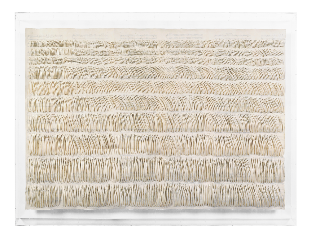
Figure 4: Here, i.e. South, 2011. © Georgia Russell