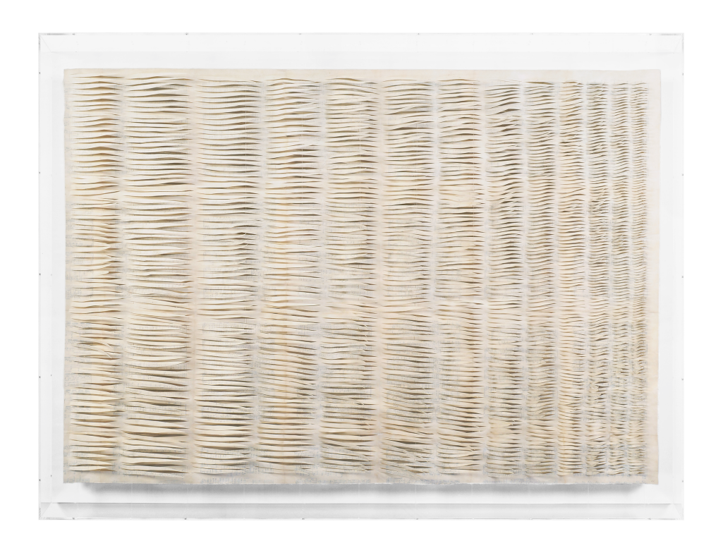
Figure 1: Here, i.e. East , 2011. {\rm @ \ Georgia\ Russell}

casts. In her works, it is also the absence of matter which paradoxically acts as a presence, as was the case for the phantom limbs Oliver Sacks studied in Hallucinations and A\ Leg\ to\ Stand\ On.