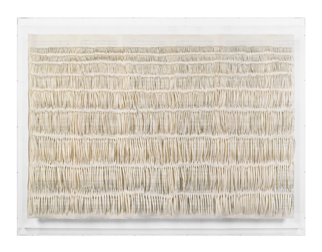
Figure 2: Here, i.e. North, 2011. © Georgia Russell