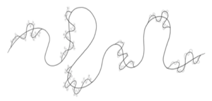
Fig.4 Curvy A.2, third step: half of the locemes have been populated by the lowest level locemes (the dots, stylised rocks) each clustered in groups, and each associated with a single noem. Here the entire script is mapping about 630 noems and could be continued.

Fig.3 Curvy A.2, second step: other quasi-self-similar locemes are added at the level below the second ones.