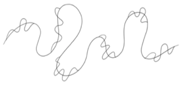
Fig.2 Curvy A.2, first step: the curve is made more complex so as to map more locemes in the same space. As a stylised river, it has more asymmetric meanders, making it slightly more memorable.

like the Bézier curves are stylised rivers. The lowest levels locemes are directly mapping noems, unlike the higher-level ones.