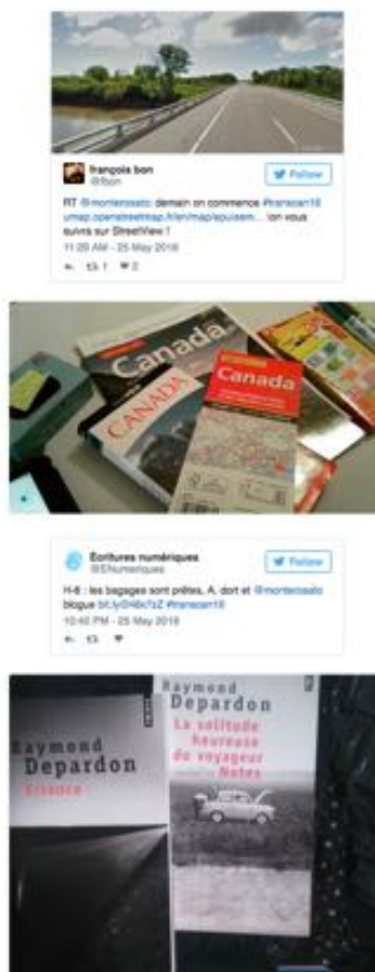
FIGURE 2 : Storify - Transcan16 (by Marie-Christine Corbeil)