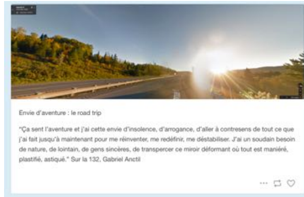
FIGURE 4 : Postcards from Street View - Transcan16 (by Servanne Monjour)

allowing our hashtag to live on, diverted, disfigured, reinterpreted.