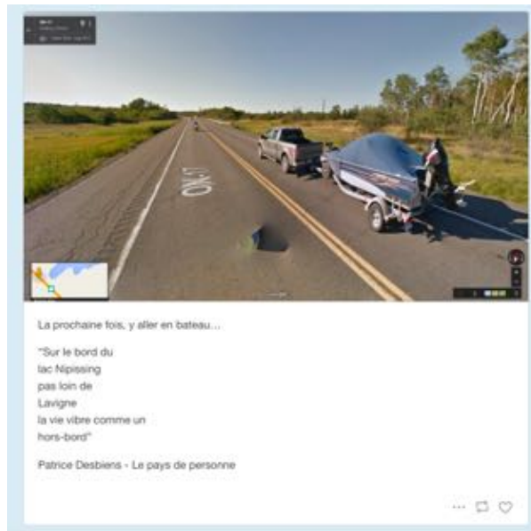
FIGURE 3 : Postcards from Street View - Transcan16 (by Servanne Monjour)

itinerary with the help of Google Maps, tweeting the progression of our trip, reading literary works about the spaces that we crossed, and producing new narratives.